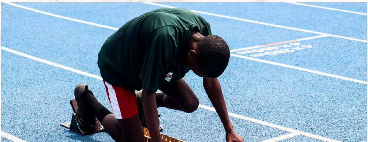
Above: Blood and sweat was the order of the day as athletes battled it out at the Richmond Sport Complex, in the uMgungundlovu 2024 District Selections Games.