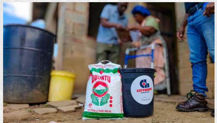
Above: The Municipality's Disaster Management Centre alongside local Councillors, Cogta, Red Cross, Gift of the Givers continued to conduct heavy rains damage assessments in Ward 4. The Municipality with its partners worked tirelessly to provide relief to affected residents.