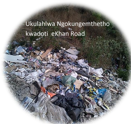
Ukulahlwa Ngokungemthetho kwadoti eKhan Road