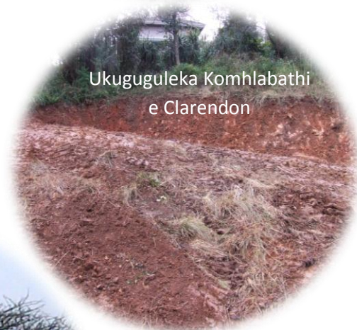
Ukuguguleka Komhlabathi e Clarendon