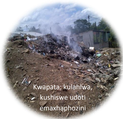
Kwapata: kulahlwa, kushiswe udoti emaxhaphozini