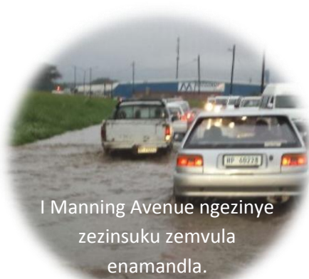
I Manning Avenue ngezinye zezinsuku zemvula enamandla.