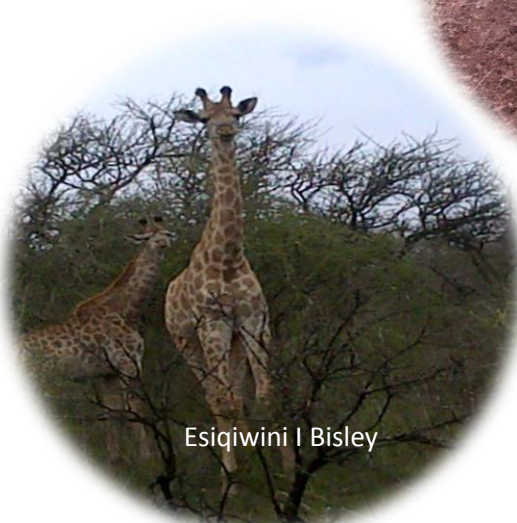
Esiqiwini I Bisley