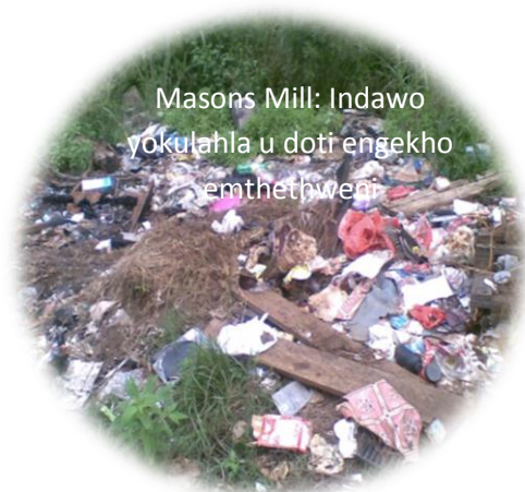
Masons Mill: Indawo yokulahla u doti engekho emthethweni