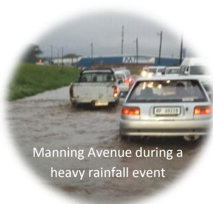
Manning Avenue during a heavy rainfall event