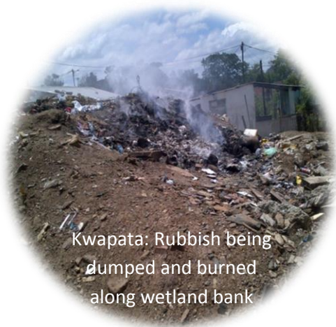
Kwapata: Rubbish being dumped and burned along wetland bank