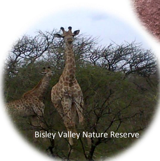
Bisley Valley Nature Reserve