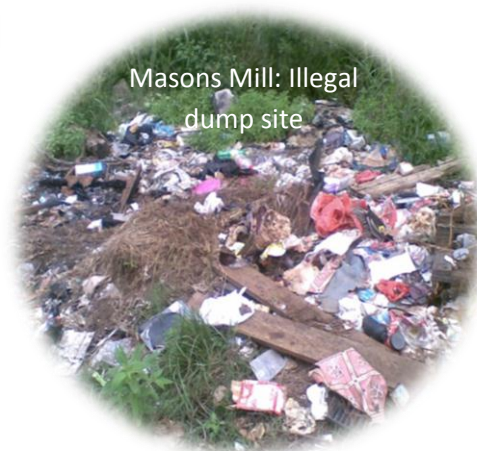
Masons Mill: Illegal dump site