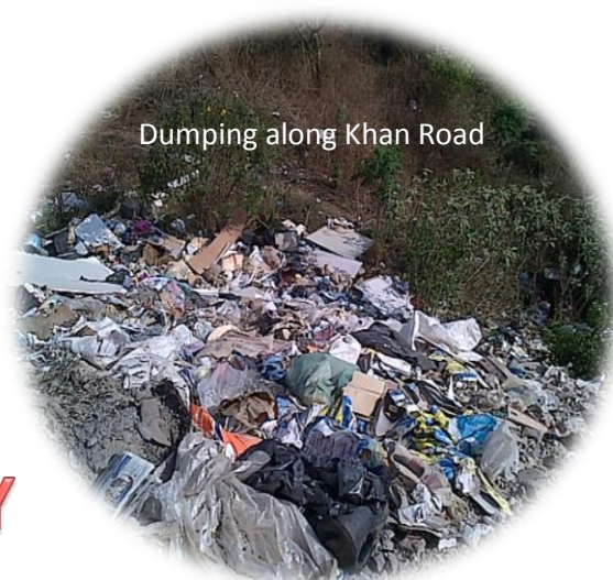
Dumping along Khan Road