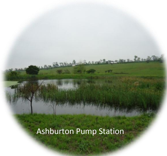
Ashburton Pump Station