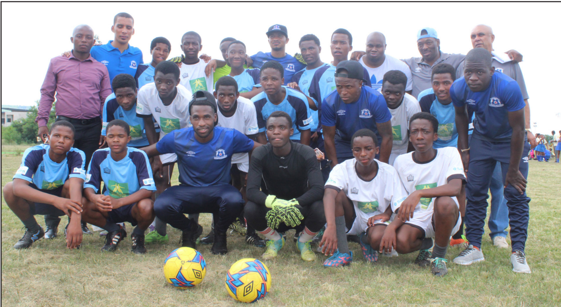
Abafundi base sikoleni sase Sukuma abathole ithuba lokulolongwa abeqembu le Maritzburg United

K WENZEKE okunga jwayelekile esikoleni samabanga aphezulu iSukuma eMbali ngenkathi iqembu le Maritzburg United lithleka kulesi sikole ngenhloso yokuzoqinisa amaxhama nalesikole.