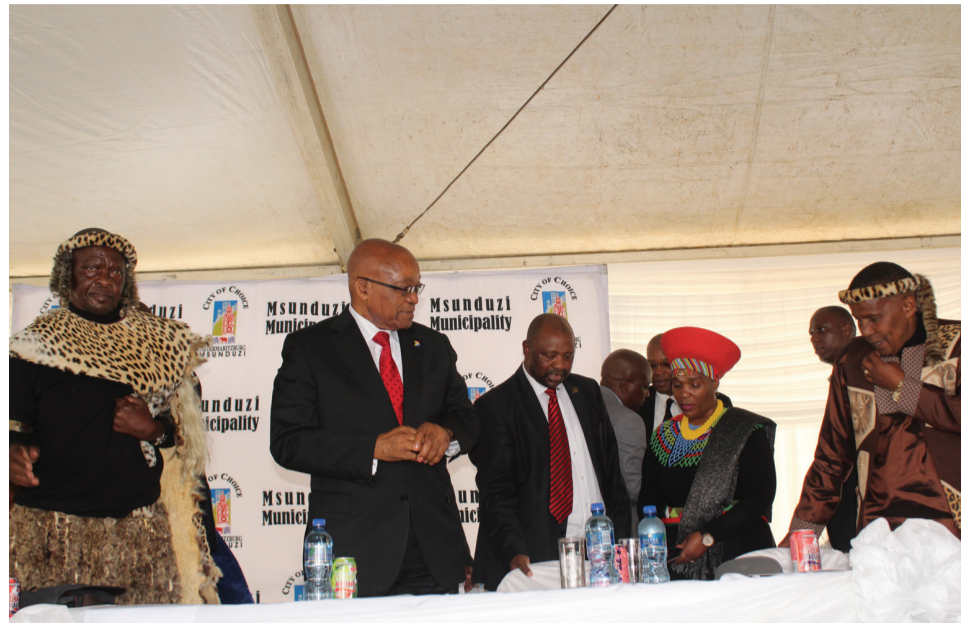
Kungesikhathi uMengameli Zuma ebingelela izinkumbi zabantu ebezikade ziyingxenywe yomgubho wesizwe sakwaZondi obungomhlaka 28 Okthoba esigodlweni sakwaMpumuza.