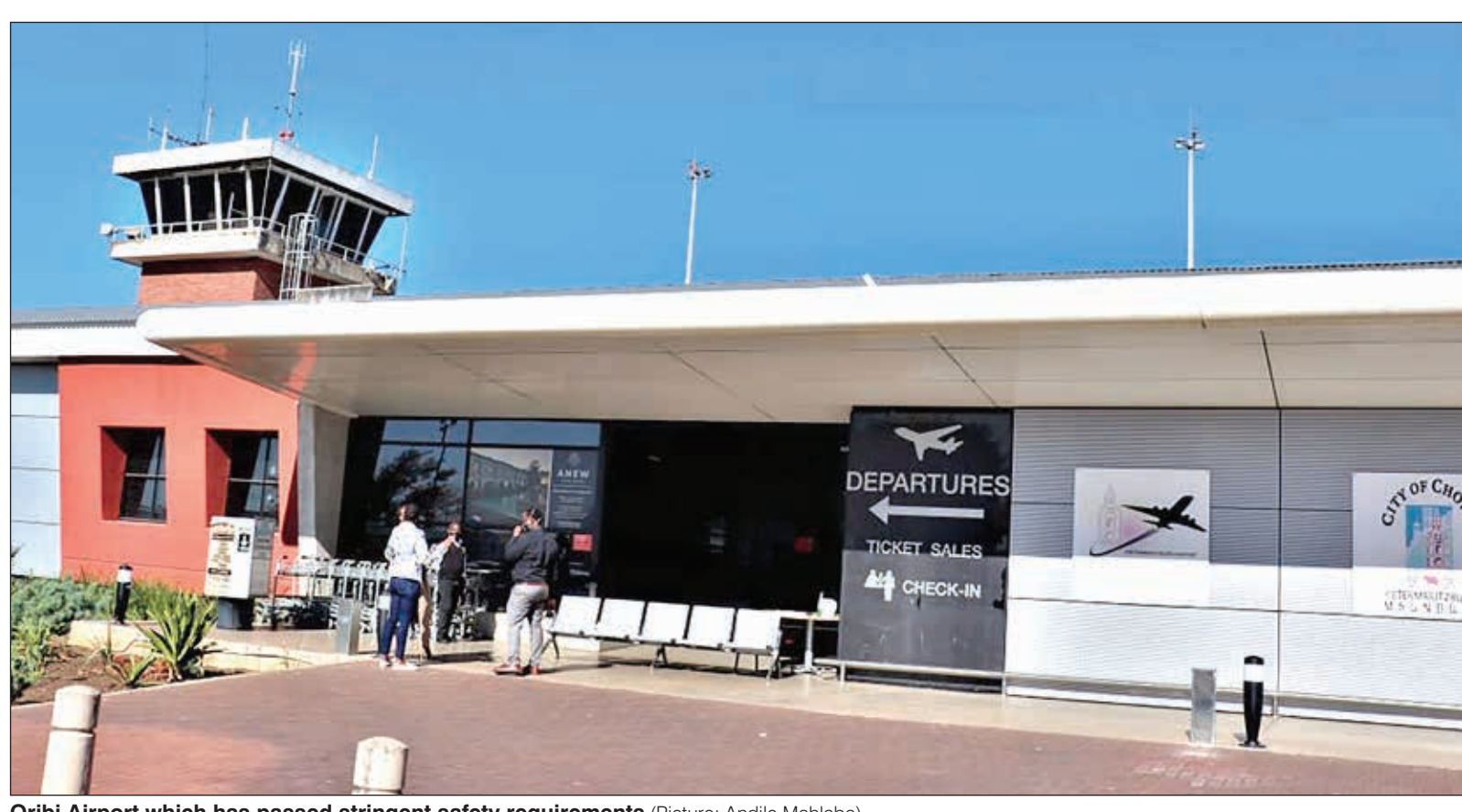
Oribi Airport which has passed stringent safety requirements

recklessness on their part could lead to a disaster which would adversely affect the local economy, safety of passengers and the lives of community members residing in the vicinity of the airport. Currently the airport has five departure flights and another five in-coming flights daily.