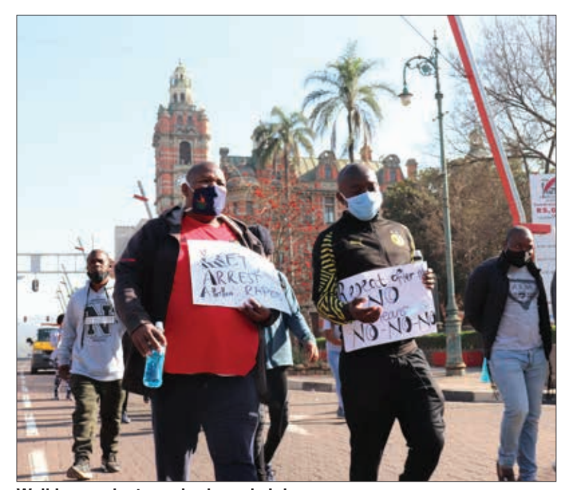
Walking against gender-based violence

She said it was a conscious decision to call it a gender-based