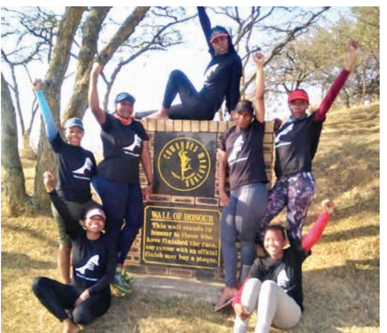
Participants in the Walkathon