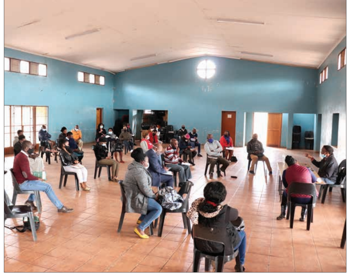
Meeting of the Local Task Team under Operation Sukuma Sakhe