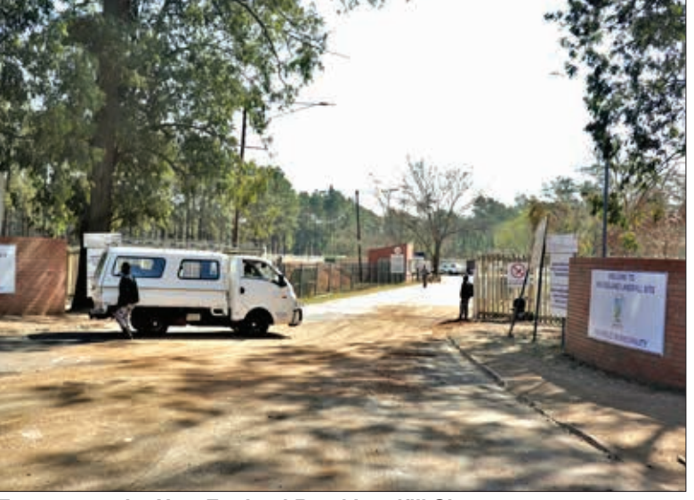
Entrance to the New England Road Landfill Site

He said as part of the solution, they followed the directive that was issued by the Department, which had to do with the regulation of the facility. The first being to check all the waste that is being brought into the landfill site to ensure that there is no hazardous material. Secondly, the staffers have to monitor the number of vehicles coming into the facility and the third measure is for the officials