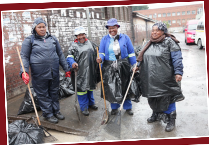
CITY CLEAN UP