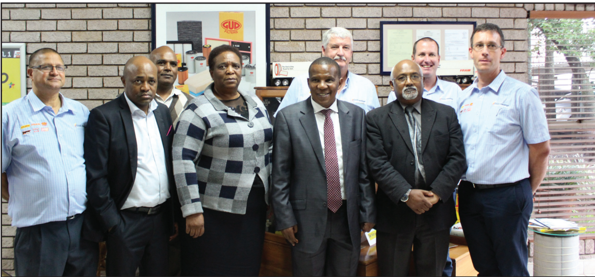
The Msunduzi Municipality delegation with G.U.D Holdings team at a meeting recently

The Msunduzi Municipality will continue playing a supportive role in ensuring economic growth by providing adequate infrastructure to businesses whether large or small.