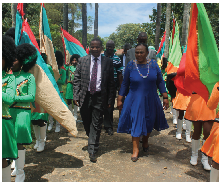
Msunduzi Mayor Themba Njilo arrives with Environmental Affairs Deputy Minister Barbara Thompson for the handover ceremony of the Alexandra Park Revitalisation Project on 24 February

A total of R12 million was spent on the project with 115 work opportunities created for locals since the inception of the project. Out of the 115 work opportunities, 57 went to women, 74 to young people and two to people with disabilities,