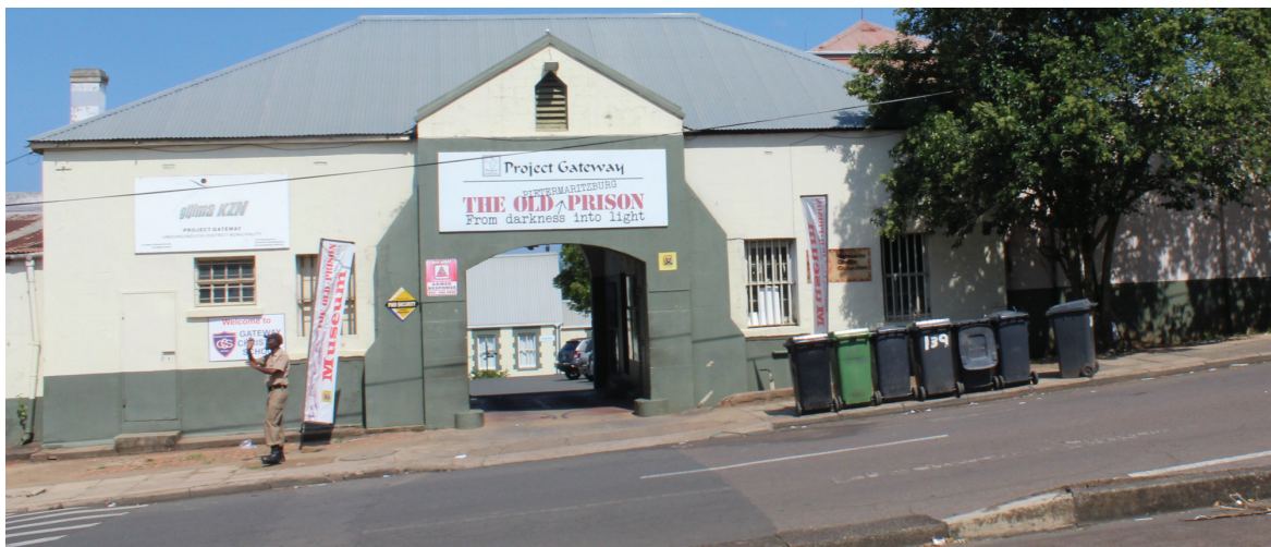
The Pietermaritzburg Old Prison which is one of the city's main attractions because of its history

This law allowed for political prisoners to be kept in solitary