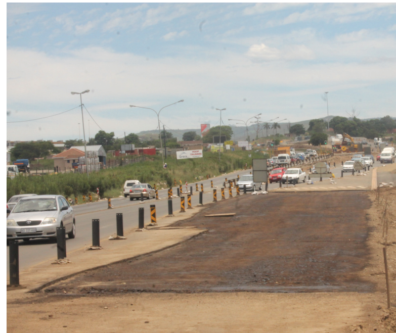
Construction on Edendale Road which forms part of the Integrated Rapid Public Transport Network

The project entails upgrading these roads to an acceptable industrial standard road with stormwater management including sidewalks, bus shelters and lighting.