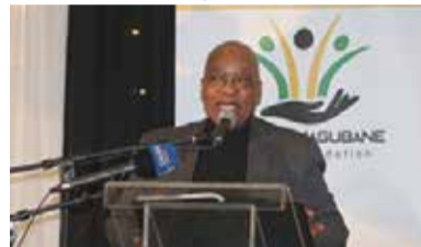
Left: President Jacob Zuma delivering the keynote address at the launch of the Truman Family Foundation.