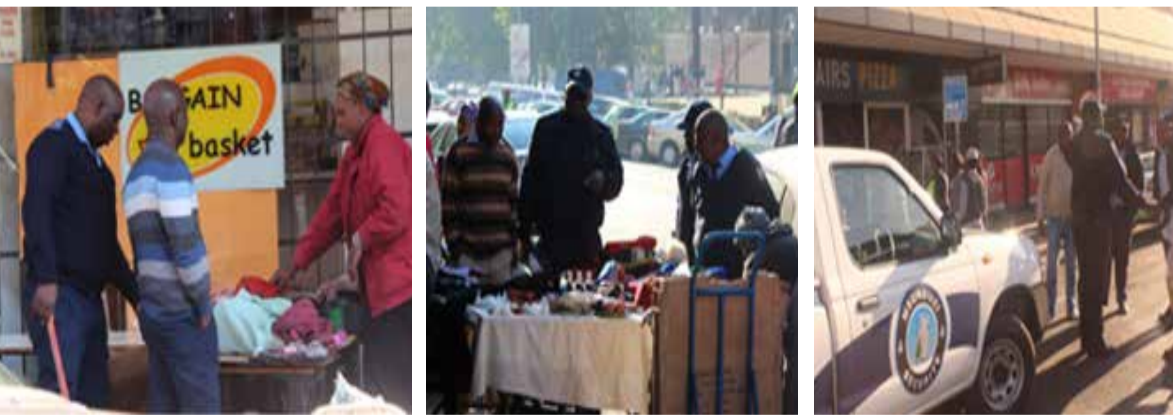
Msunduzi Municipality Security checking whether street traders are operating with legal permits as part of the clampdown to make sure that trading in the city streets is carried out legally.

The Msunduzi traffic department and security division recently conducted an operation along Church Street aimed at ensuring that street trading entrepreneurs were compliant with Msunduzi bylaws.