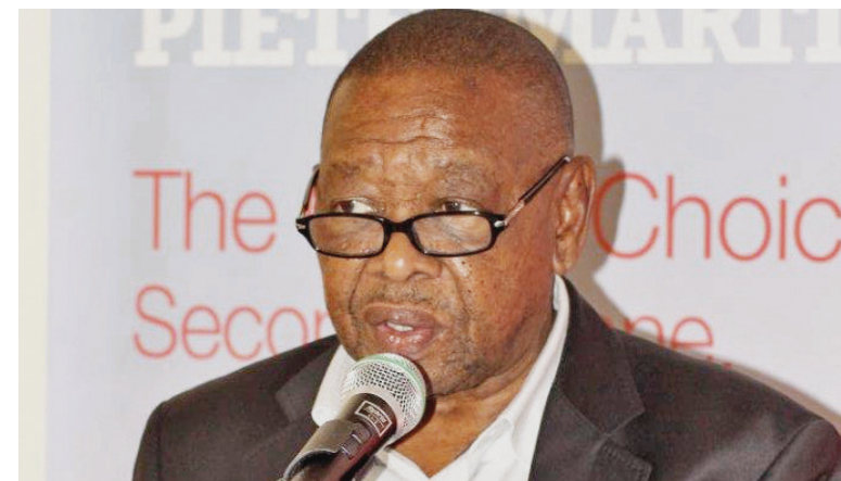
Higher Education Minister Dr Blade Nzimande launched the Tourism Skills Programmes in the city recently

The launch follows a thorough look by MPTA on the requirements for a thriving tourism locally. Skills development was identified as the key mechanism to drive sector