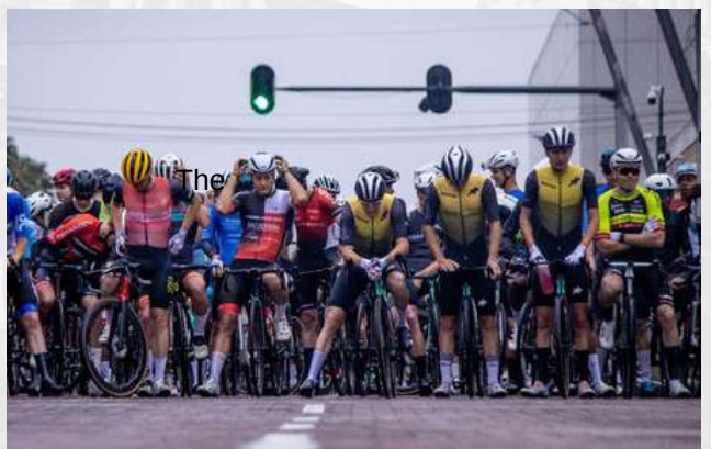
The Annual Amashova Durban Classic Race took off from the City Hall to Durban. The Mayor wished all participants a good and safe race.