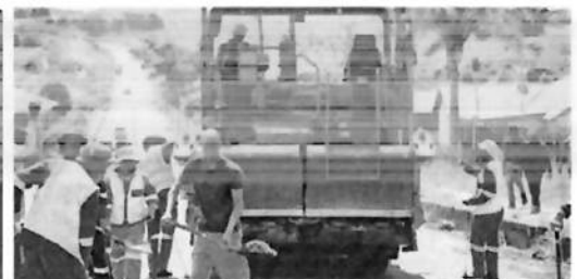
Roadworks in Richmond.

N.M. NGCOBO, IMENENJA YEDOLOBHA (IBAMBA)