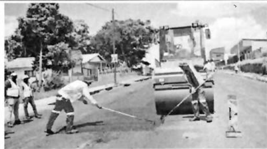
Shepstone Street in Richmond gets a long-overdue resurfacing.