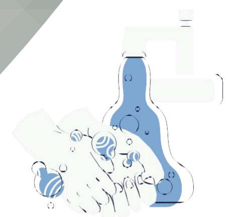
GEZA IZANDLA ZAKHO NGAMANZI NENSIPHO