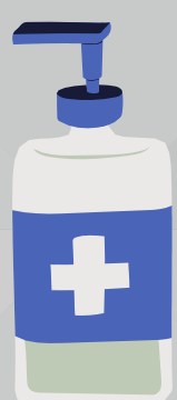
SEBENZISA ISIBULALI MAGCIWANE

Uma unemibuzo, shayela ucingo ku- 033 392 2426/ 033 392 3680 .