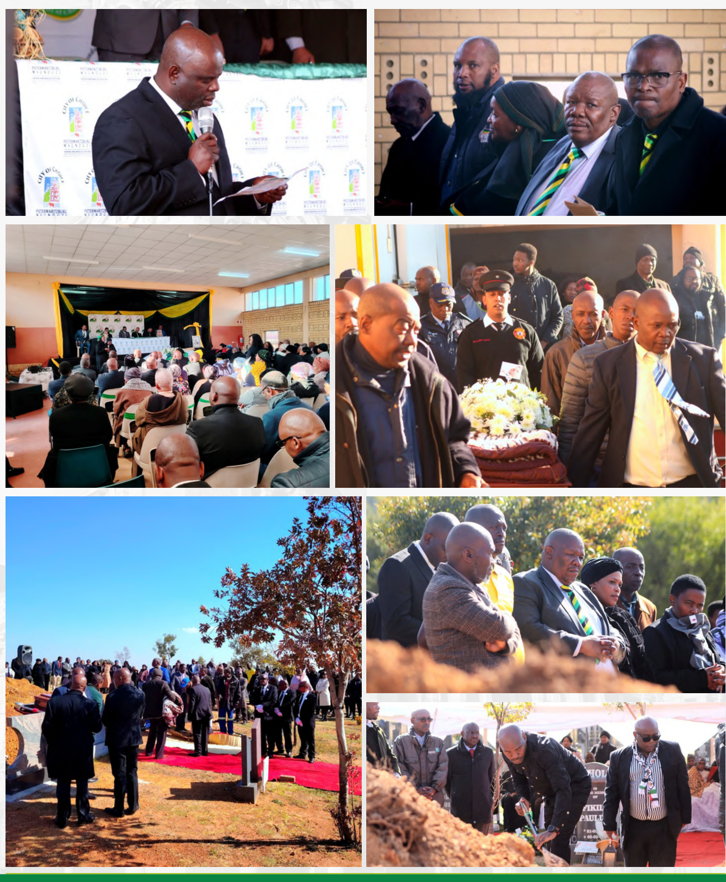
"By 2040 Msunduzi will be a safe, vibrant, sustainable and smart metropolis."