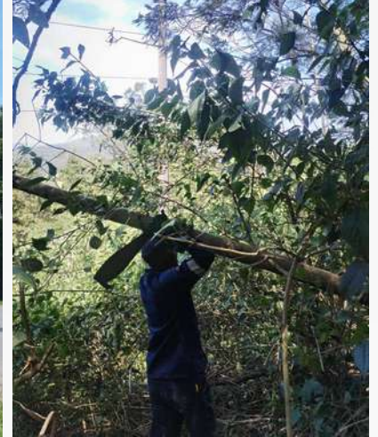
Msunduzi Municipality's Parks Department responding to fallen trees following strong winds.