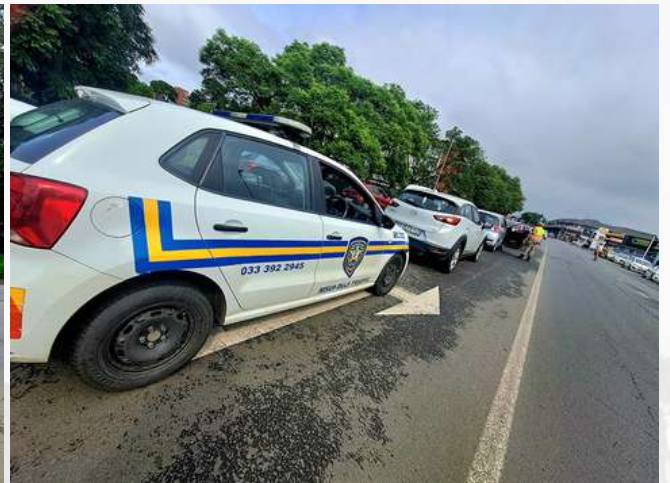
Traffic wardens conducting a stop and search for traffic fines and warrants and overall road compliance on Chief Albert Luthuli Street (Commercial Road)