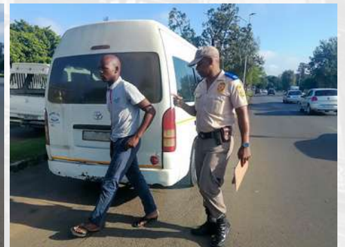
CVP Operation held in Alexandra Road/Jesmond Road, outside Maritzburg Girls High School.