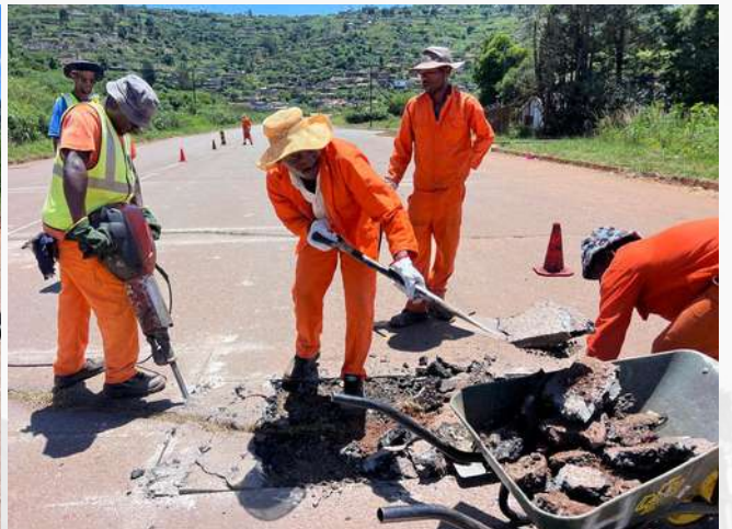
Copesville Drive given some much-needed TLC with pothole patching