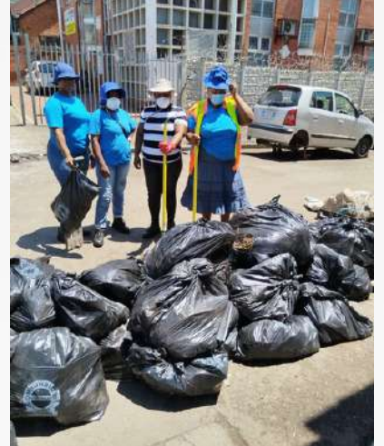
The municipality is committed to providing residents and visitors with a clean and welcoming city.