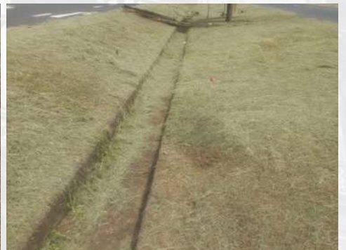
Grass cutting was carried out today, ensuring a cleaner and safer environment for our residents.