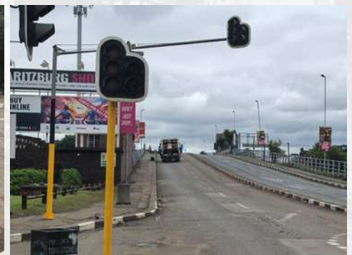
Msunduzi Municipality is dedicated to maintaining a cleaner city.