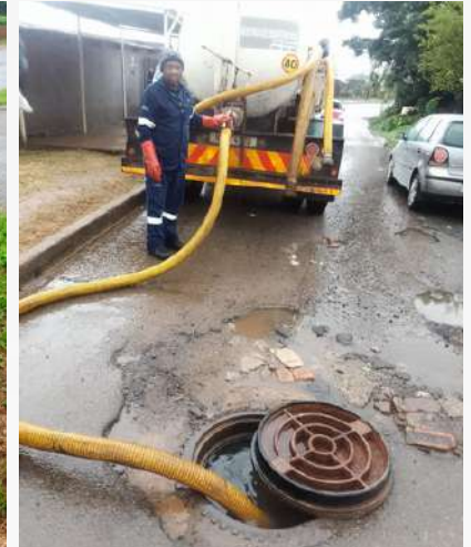
Our sanitation teams actively addressing reported blockages in both the CBD and residential areas, demonstrating excellent service delivery to our communities