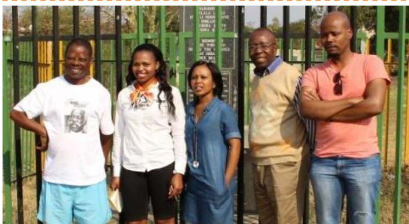
KZN National Botanical Gardens visited local community parks (Inkosi Mhlolo Community Park at Nadi and Peace Monument at Imbali). The aim of visit was to identify needs and support needed.