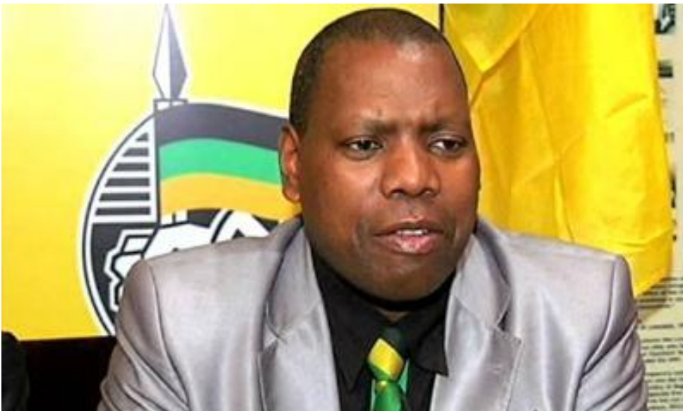
Dr Zweli Mkhize