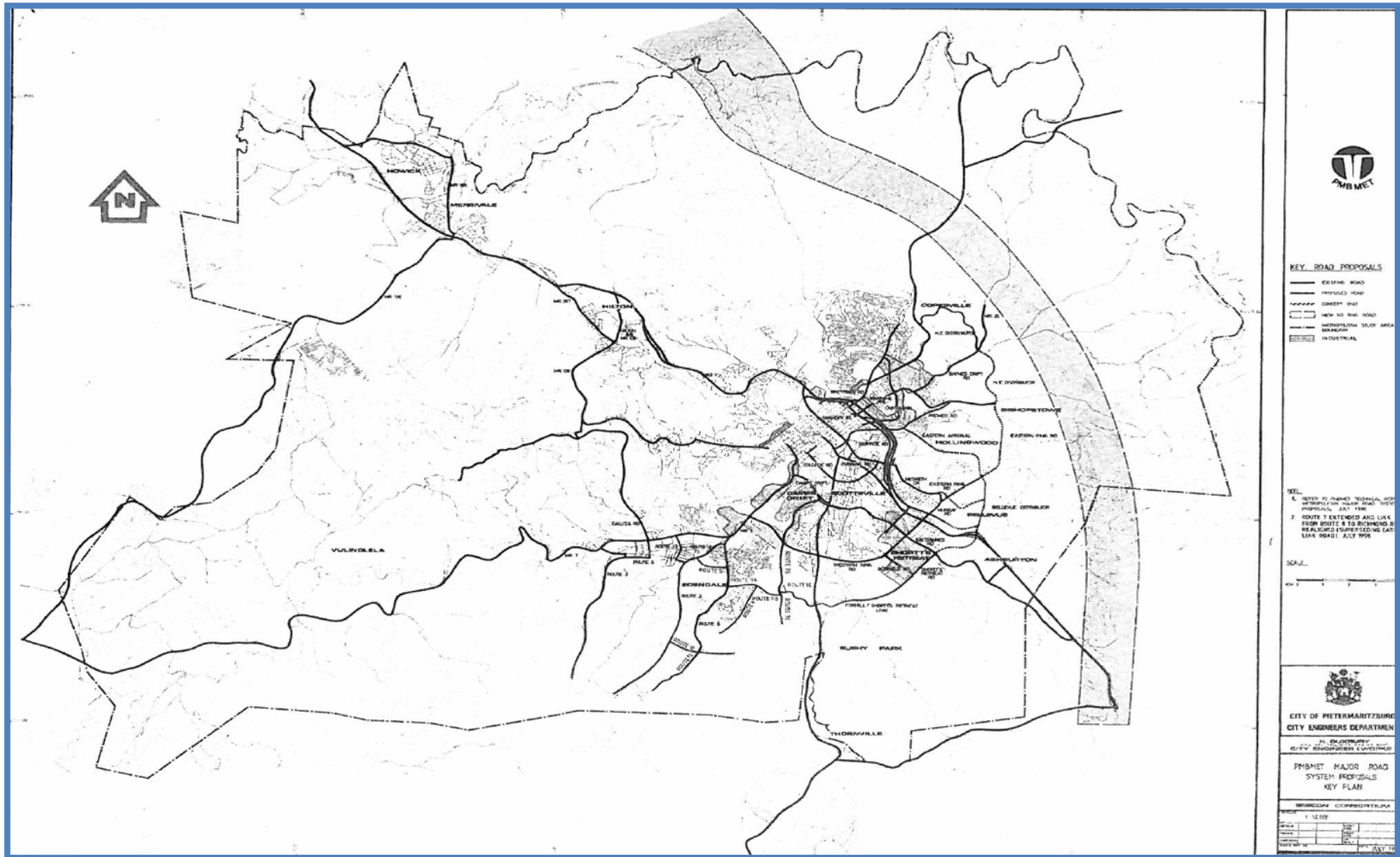
Annexure B: Extract from 'PBMET Major Road System Proposals Key Plan'