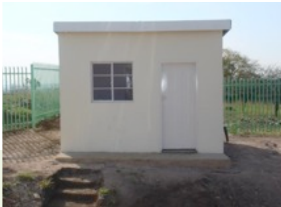
Grange Garden Site