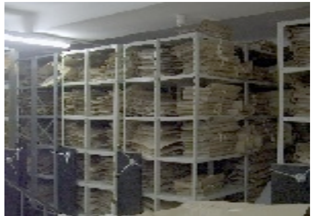
Periodicals Department ~ Stack Area