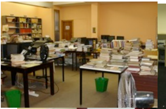
Cataloguing Department ~ After

The Cataloguing Department was completely re-furbished and new desks and shelving were installed by March 2007.