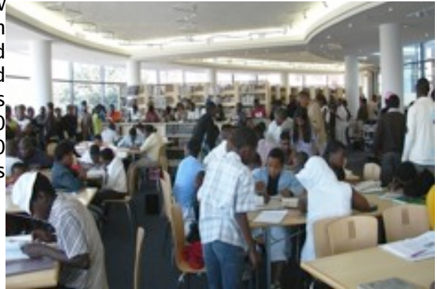
Children's Reference ~ Saturday Mornings

The Children's Reference Library in the new wing is well stocked and is bright and airy with new furnishings. The atmosphere and surroundings are most conducive to study and it is heavily used. Up to 900 learners use this facility on a Saturday morning and about 400 per day during the week. Approximately 16000 photocopies are made each month by students doing projects