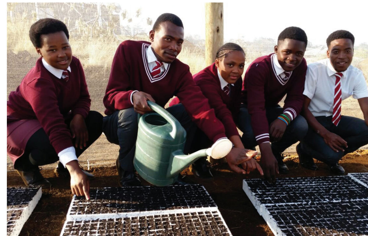
Wildland's Conservation Trust took an active lead for this year's celebrations at the Msunduzi Community Hub, which is located at Insika Secondary School in Sweetwaters. Wildlands' staff tackled a variety of tasks, including painting and beautifying of the school, mulching, vertical planting, sorting out clothing for their Clothes for Life Project, as well as litter collection around the school.