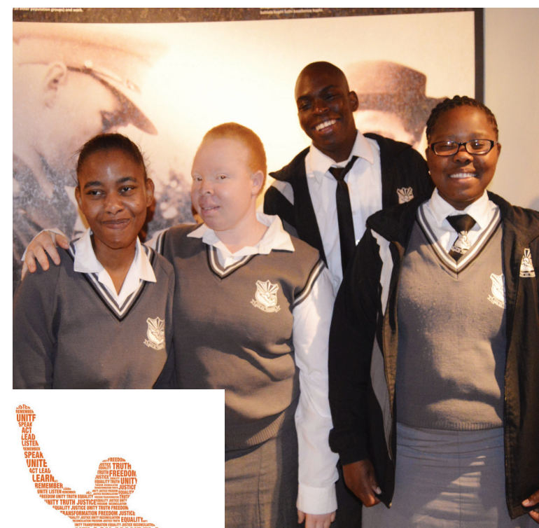
In celebration of Mandela Day the KZN Museum invited learners from the Arthur Blaxall School to spend a morning "behind the scenes" at the museum. The learners got to meet museum staff - from researchers, artists, and technical specialists to learnt all about what goes on behind the scenes at the museum. The morning of learning concluded with a tour of the Museum and ended with a delightful lunch and birthday cake. It was definitely an educational experience for all involved and a memorable one too.