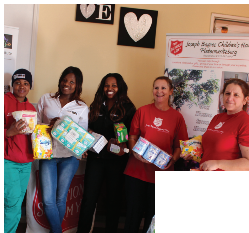
Once again the second annual toiletry drive at the KZN National Botanical Garden for Mandela day was a success. The wonderful patrons of the beautiful and tranquil KZN National Botanical Gardens made donations of the toiletries and most of them contributed financially. The Botanical Gardens team went to buy toiletry items and infant formulas and nappies for the infants who reside at the home. The donations were made to the Salvation Army children's home. Further to that the KZN National Botanical Garden's team planted fruit trees and indigenous trees at the home.