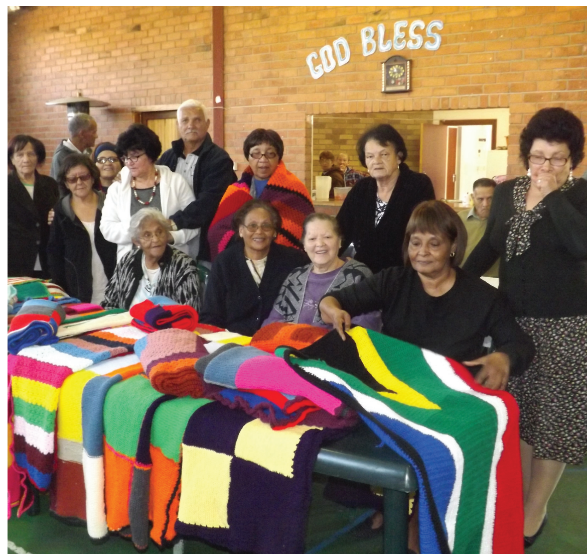
As a contribution to the Community Chest Mandela Day campaign, the Tucebon Senior Citizen Club hand knitted over 30 colourful fluffy blankets for charity. The Woodlands based organisation, consisting of 39 elderly members, extended the challenge this year after their successful campaign last year. In honouring Madiba's legacy in 2015, the organisation provided a smile for many underprivileged Woodland's Primary School pupils when they knitted scarves and jerseys matching the school uniform.

On July 18, businesses, organisations, individual community members from Pietermaritzburg came out in numbers to observe the 2016 Nelson Mandela International Day by engaging in a range of activities aimed at assisting communities in need of help. The Nelson Mandela International Day was launched by the UN General Assembly in recognition of Nelson Mandela's birthday on July 18, 2009. It was inspired by a call Mandela made a year earlier, for the next generation to take on the burden of leadership in addressing the world's social injustices when he said that "it is in your hands now". By devoting 67 minutes of their time – one minute for every one of the 67 years Mandela spent fighting apartheid - people can make a small gesture of solidarity with humanity and a step towards a global movement for good. Below are some of the activities that took place in and around Pietermaritzburg on Mandela Day.