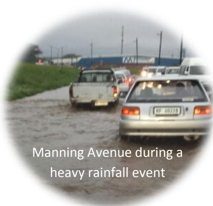
Manning Avenue during a heavy rainfall event