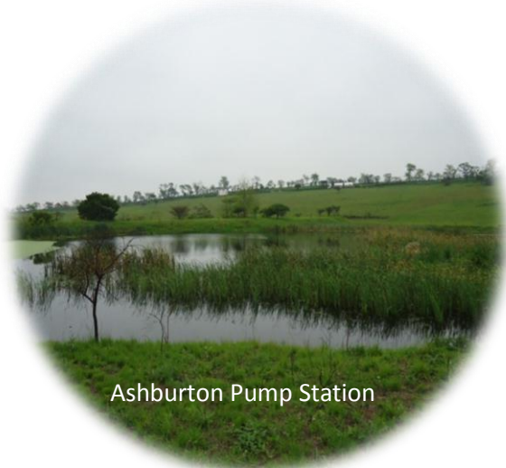
Ashburton Pump Station