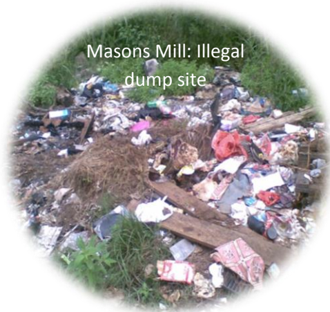
Masons Mill: Illegal dump site