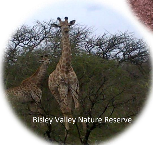
Bisley Valley Nature Reserve