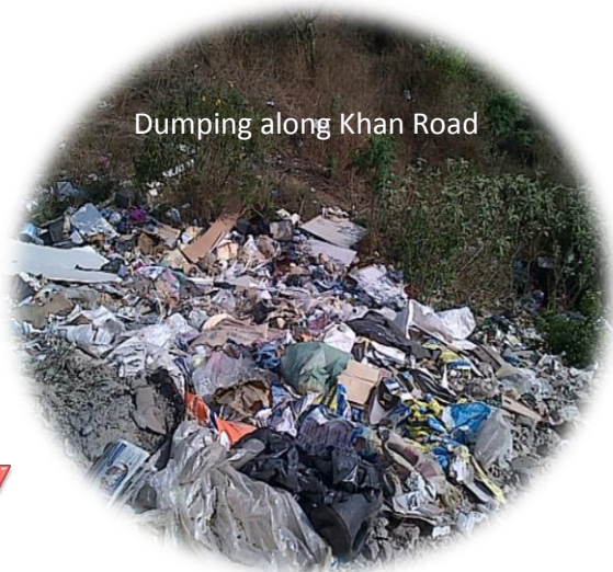
Dumping along Khan Road