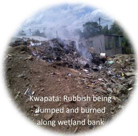
Kwapata: Rubbish being dumped and burned along wetland bank