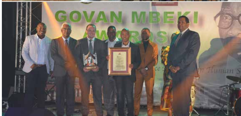
Msunduzi Municipality wins Best Social Housing Project for the Westgate Aloe Ridge at the Govan Mbeki awards held in Durban.

The Msunduzi Municipality's efforts in providing adequate housing to residents were recognised when the municipality won the Govan Mbeki Award recently.