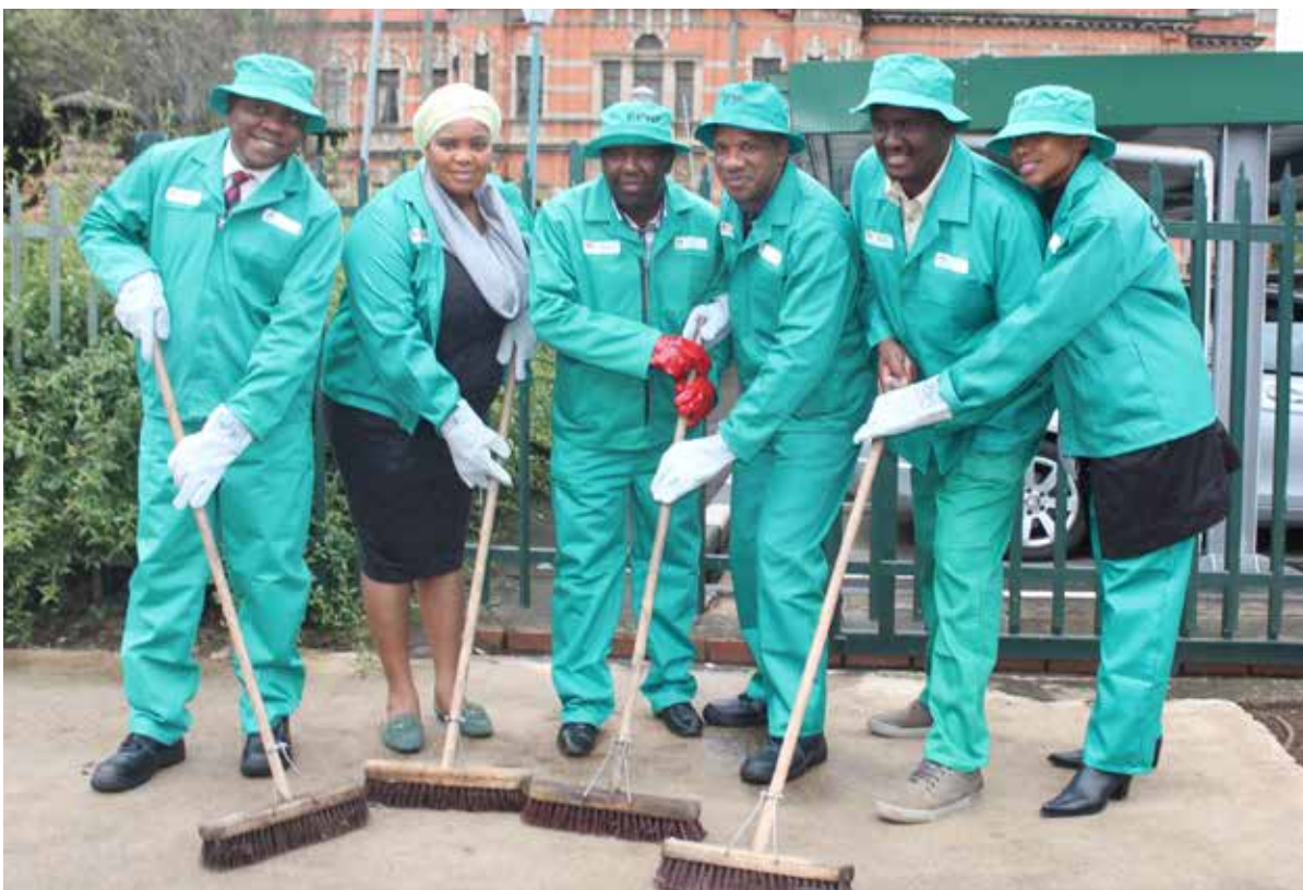
Abamele iDepartment of Public Works, uMasipala woMngungundlovu kanye noMasipala Msunduzi behola umkhankaso wokugcina idoloba lasePietermaritzburg lihlanzekile.