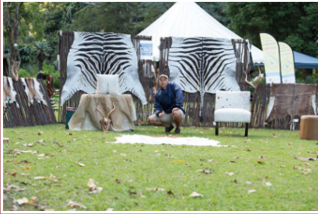
ART IN THE PARK