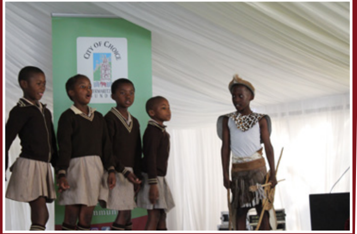
SLANGSPRUIT DIGITAL LIBRARY