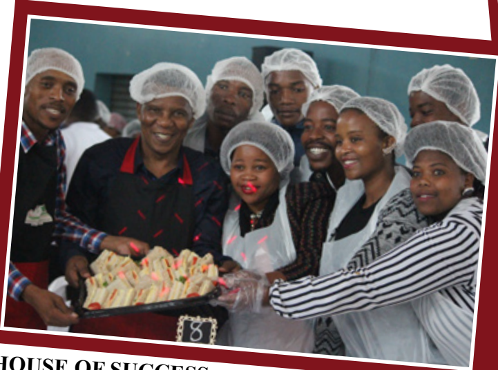
HOUSE OF SUCCESS