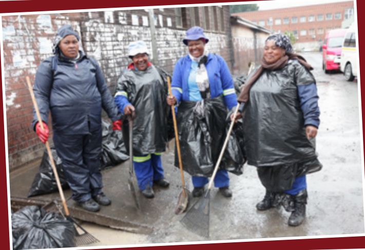
CITY CLEAN UP