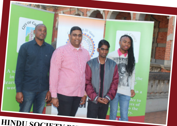
HINDU SOCIETY BURSARY AWARDEES