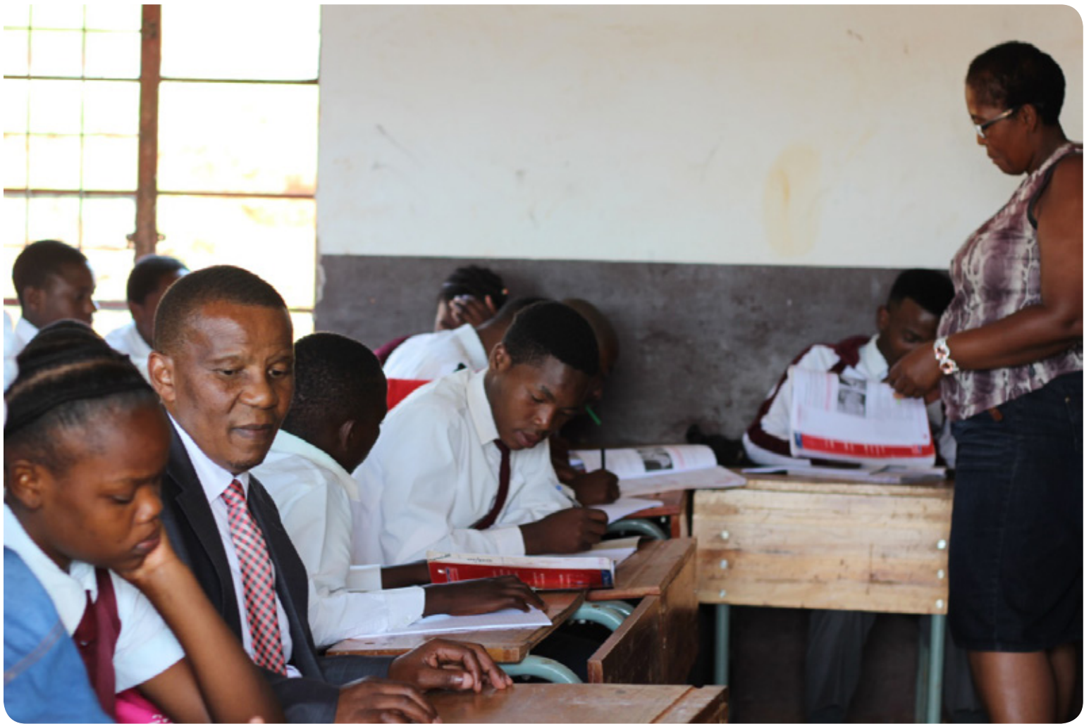
Mayor sits and watches the learners as they begin their programme at Imvunulo High School