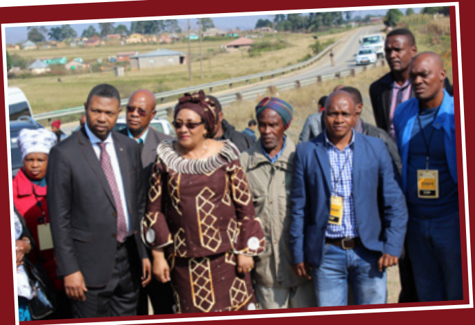
SOD-TURNING AT GWAGWA