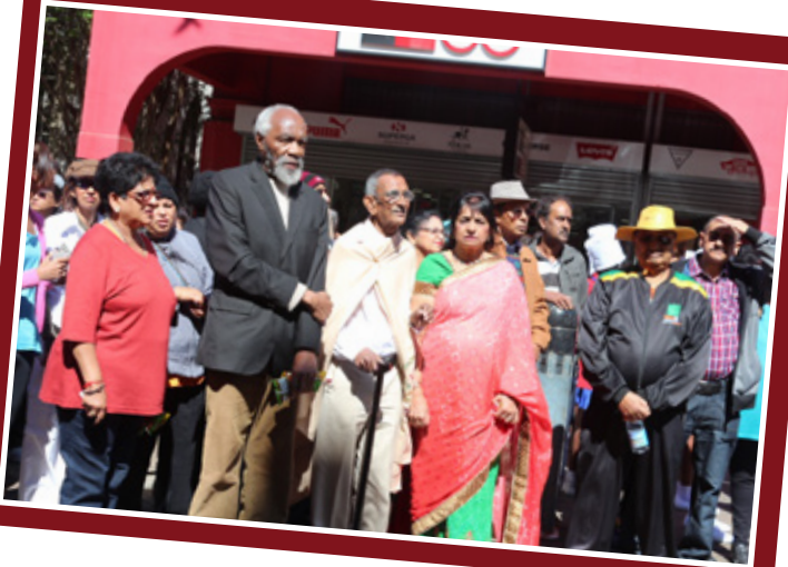
GHANDI PEACE WALK