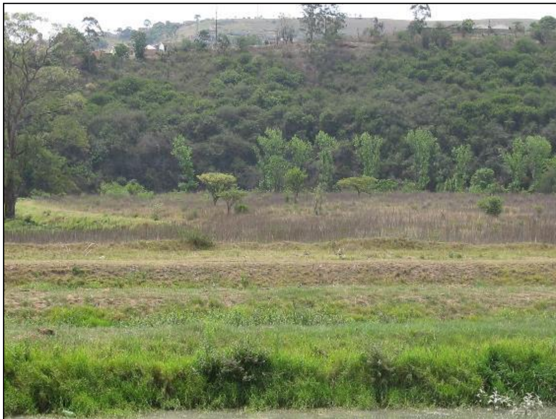
Figure 3. Surrounding Area.