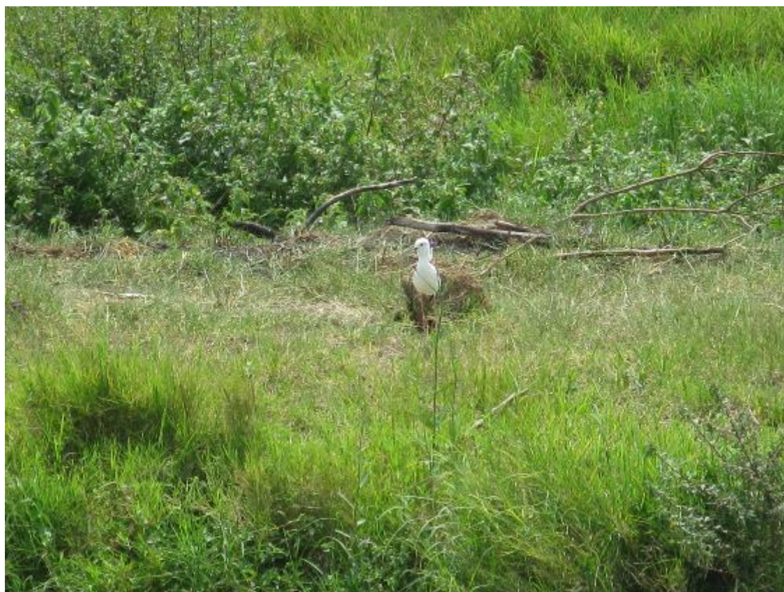
Figure 4. The potential for development into a wetland is apparent.