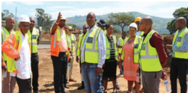
Msunduzi councillors inspecting progress along Edendale Road where construction for the Intergrated Rapid Public Transport Network is taking place

The IRPTN incorporates a Bus Rapid Transit (BRT) system,