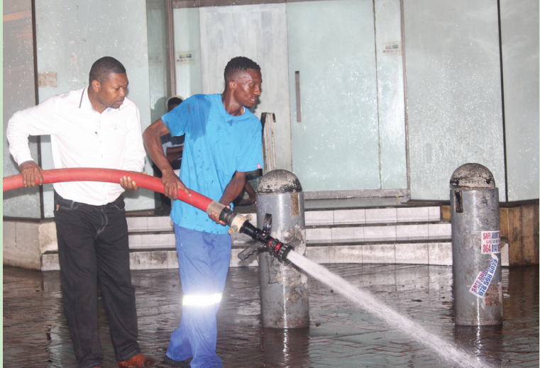
Msunduzi Deputy Mayor Thobani Zuma assisting a municipal employee to clean Timber Street

The cleanliness of Pietermaritzburg rests on the shoulders of each one of the city's residents.