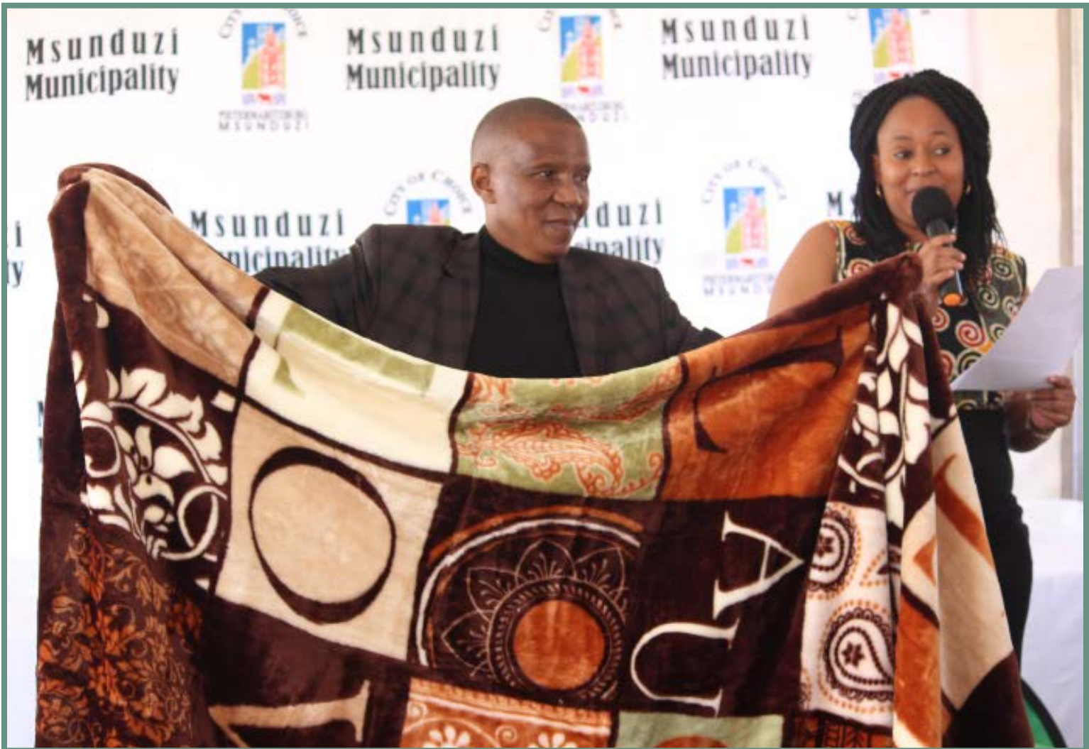
The honourable Mayor Cllr T Njilo handed over blankets, food parcels, wheel chairs and launched a housing project at Maswazini in Ward 8. He also handed over wheel barrows to be used to fetch water.