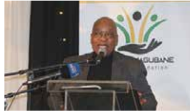
Left: President Jacob Zuma delivering the keynote address at the launch of the Truman Family Foundation.