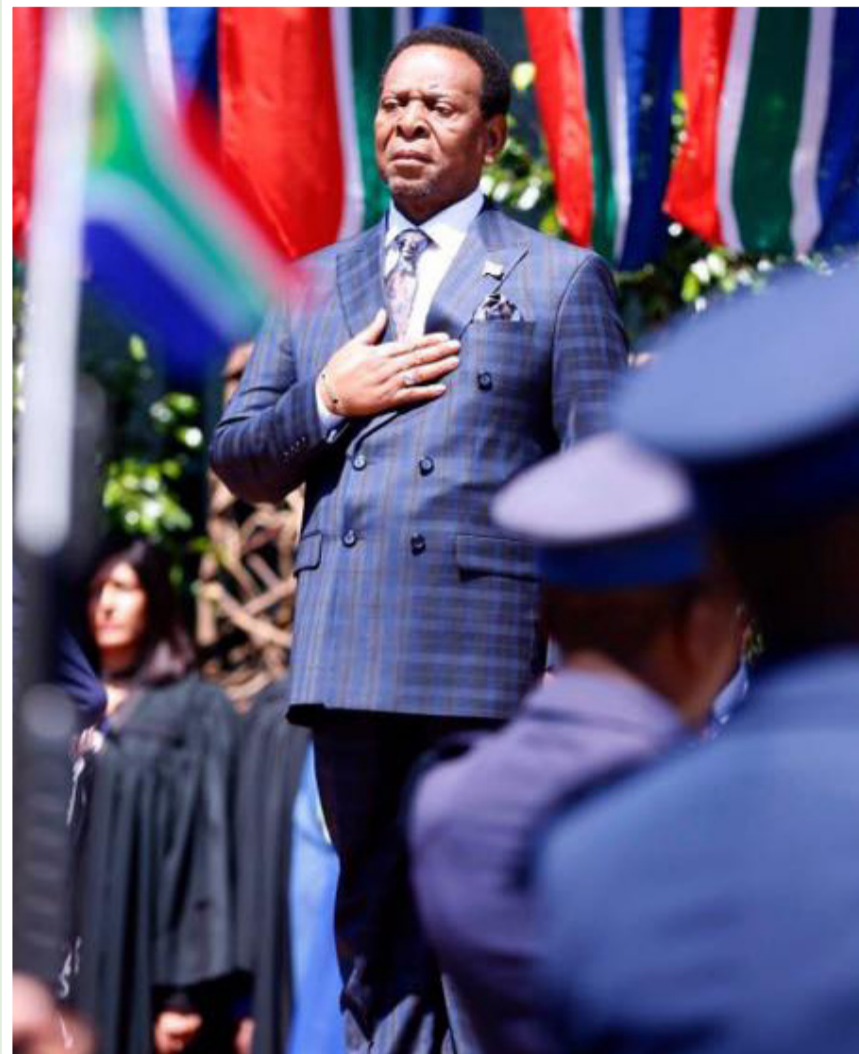
Zulu King Goodwill Zwelethini observes the national anthem ahead of delivering the keynote address to mark the opening of the fifth KZN Legislature at the Royal Showgrounds on February 27.

"I applaud Zuma's decision of February 14 and only a fool would not appreciate that what he did ensured that our country is not plunged into crisis as it sometimes happens in other African countries," said the king.