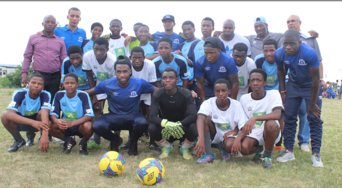
Abafundi base sikoleni sase Sukuma abathole ithuba lokulolongwa abeqembu le Maritzburg United

K WENZEKE okunga jwayelekile esikoleni samabanga aphezulu iSukuma eMbali ngenkathi iqembu le Maritzburg United lithleka kulesi sikole ngenhloso yokuzoqinisa amaxhama nalesikole.