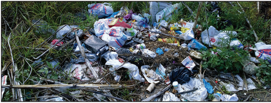
One of the illegal dump sites that the Municipality is tackling as part of the program to keep the city and its surrounding clean.