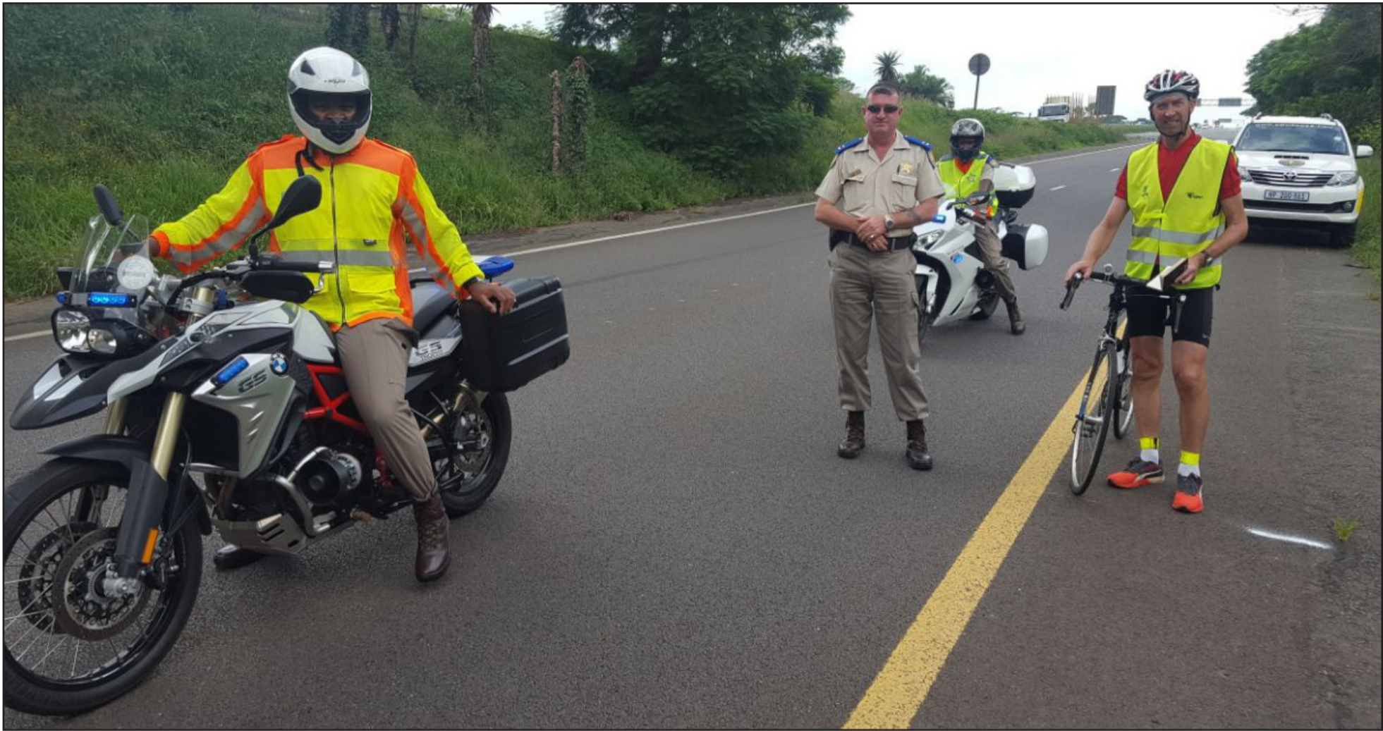
Msunduzi Traffic assisting during the Comrades route measurement for the 2018 down run